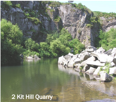
2 Kit Hill Quarry

ceremony, half Christian, half pagan and performed in Cornish. Also around the stack there are three viewing tables or toposcopes which give a guide to the surrounding countryside. From Kit Hill summit follow the road down the hill and take the second track on your left. Follow this track (marked with blue arrows) to Kit Hill Quarry [2]. Information board here. Turn left after leaving Quarry and follow signs until you come to a gate. At the