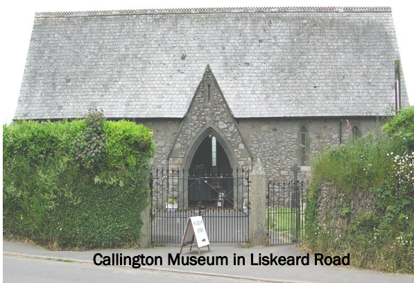
Callington Museum in Liskeard Road

Turn left and follow footpath/track up to Pencreber Farm. Pass through the farm and walk along the tamaced road to a marked footpath on your left on the bend. Go through the metal gate, across the field, over the stile and you are in Liskeard Road. Turn left and follow the road to town. On your left is the Chapel and Cemetery. The Chapel houses the Callington Museum which has the history of the town, mines and associated information.