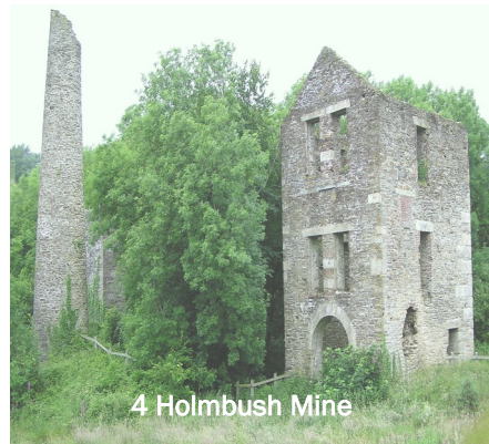
4 Holmbush Mine

a mine that spread from Redmoor, through Holmbush and across to Winsor. Arsenic, copper, tin, lead, iron, silver and wolfram were all mined here and the success of these mines, which at one time employed over 250 people greatly contributed to the expansion of Callington. The remains are in good condition and have recently been stabilised but please proceed with caution. Carefully walk through the mine area keeping the hedge on your